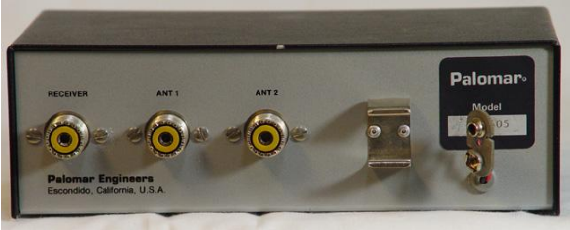
Rear Panel Layout